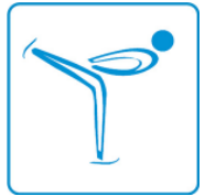
Figure Skating Medal Standings